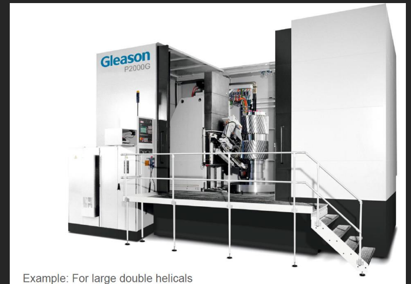
Example: For large double helicals